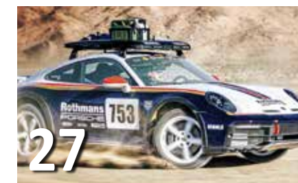
Poker Rally Fun Run